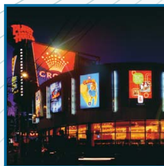
Melbourne Crown Casino

Visual Communication via the use of a corporate logo as a "sky sign" on a building or as a pylon on a dealership is the key identifying factor to deliver your corporate imagery. Whether you are about to embark on a major re-imagining programme with multiple sites or identifying your head office building you can rely on Russell's to design, manufacture and maintain your corporate signage to exacting specification.