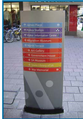
Adelaide City Council

We want to help your company or organisation to become a 'household name' by creating highly impressive and innovative signage and advertising.