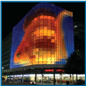
Adelaide City Council